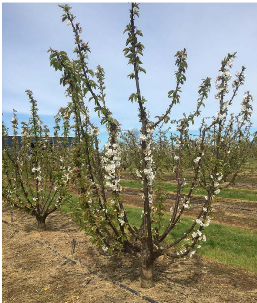
Figure 4: Note the effect of vigour within the same tree (Rainier) where bloom is delayed on strong branches compared to the weaker/desired limbs. Trees were treated with RBAs.