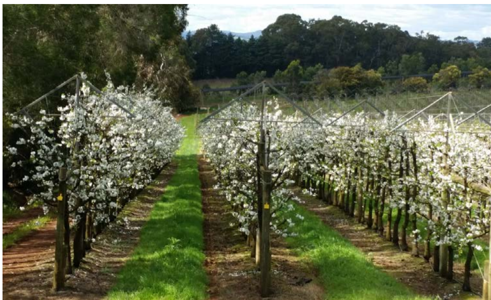
Figure 2 (a): Uniform blossom break with very little vegetative growth when chill requirements have been satisfied (from left to right: Tieton on Gisela 5 with except for the first 8 trees in row 3, which are Bing on G5). (Photo: C. Brunt).

The photographs below (Figure 2) show budbreak when (a) chilling requirements have been met, and (b) when they have not.