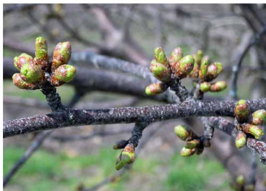
Figure 6: Cherry bud at greenside development

Alternatively, single sine or single triangle models can be used in calculations. Growing degree day calculations should be based on observations and begin at green side (shown in Figure 6).