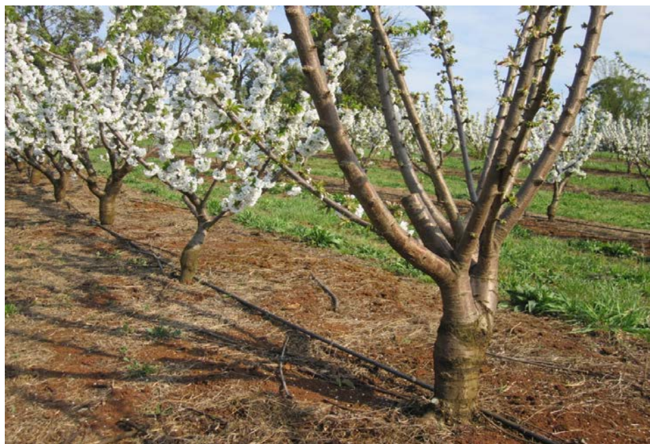
Figure 2(b): The tree in the foreground (Sweetheart on Colt) shows signs of insufficient chill. Note how the vegetative buds broke before the fruit buds (also see Figure 4 on page 11). The trees in the background (Sweetheart on Gisela) do not show signs of insufficient chill (photo: M. Chapman).

Given these adverse impacts, cultivar specific information in the scientific literature is scant and confusingly, requirements are reported using many different chill models, methodologies and units.