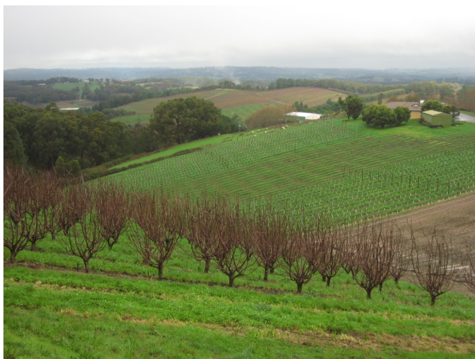
Figure 1: Dormant cherry trees

Cherry trees originated in the cold climates of Europe and western Asia. As an adaptation to very cold winters, cherry trees enter a period of dormancy designed to protect cold-sensitive tissues such as shoots and flowers from freezing injury (Darbyshire, 2016). Successful release from dormancy requires a specific minimum cold temperature requirement be met for growth to resume when temperatures warm in spring. This cold temperature requirement is cultivar specific and referred to as the “chilling requirement”. Dormant trees in an Australian cherry orchard are shown in Figure 1 below: