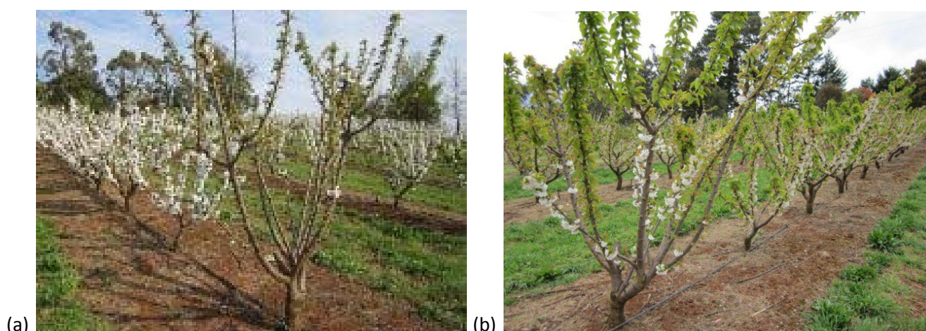
Figure 4 (a) Sweetheart on Colt in the foreground, Sweetheart on Gisela 6 in the background (b) a week later. Also see Figure 2(b).

Photo 4(a) shows that while Sweetheart on Gisela 6 is in full flower, Sweetheart on Colt exhibits only vegetative growth and possible signs of insufficient chill. Photo 4(b) shows the same trees a week later.